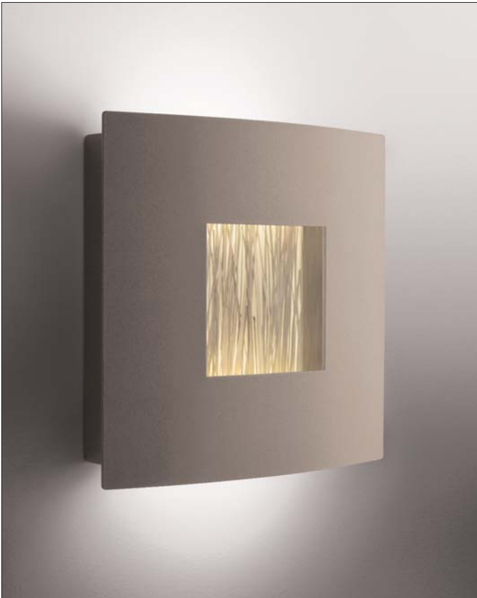
AIW1504 (SHOWN IN PT31 WITH TPBG OPTION)