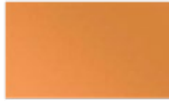
PCU POLISHED SOLID COPPER*