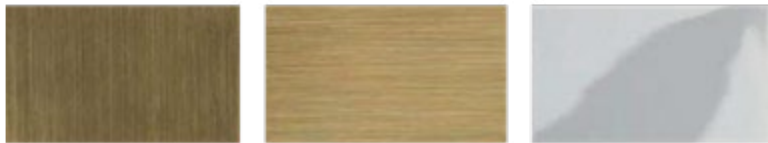
ATBR ANTIQUE TINTED BRASS*