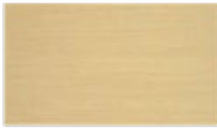
BBST BRUSHED BRASS PLATED STEEL*