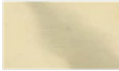
PBST POLISHED BRASS PLATED STEEL*