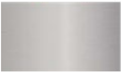
SNST SATIN NICKEL PLATED STEEL*