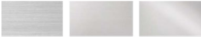
BAL BRUSHED ALUMINUM*