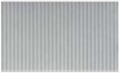
ES1 EMBOSSED STAINLESS STEEL LINEAR PATTERN*