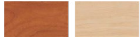
WF1 CHERRY LAMINATE*