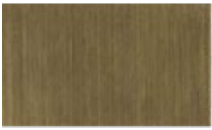
ANST ANTIQUE BRASS PLATED STEEL*