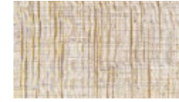
FB05 JUTE LINEN