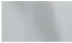
CPST CHROME PLATED STEEL*