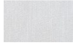
FB01 TEXTURED WHITE LINEN