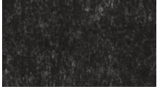
AP01 DARK HEATHER GRAY