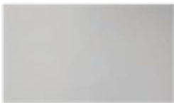
AN01 ANODIZED SATIN*