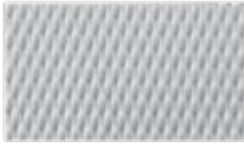
ES2 EMBOSSED STAINLESS STEEL CROSSHATCH* PATTERN