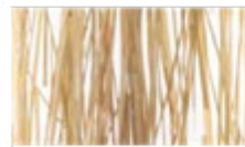
TP01 VERTICAL BEAR GRASS*