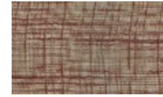
FB03 CHOCOLATE LINEN