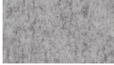
AP02 LIGHT HEATHER GRAY