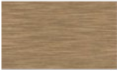
BCU BRUSHED SOLID COPPER*